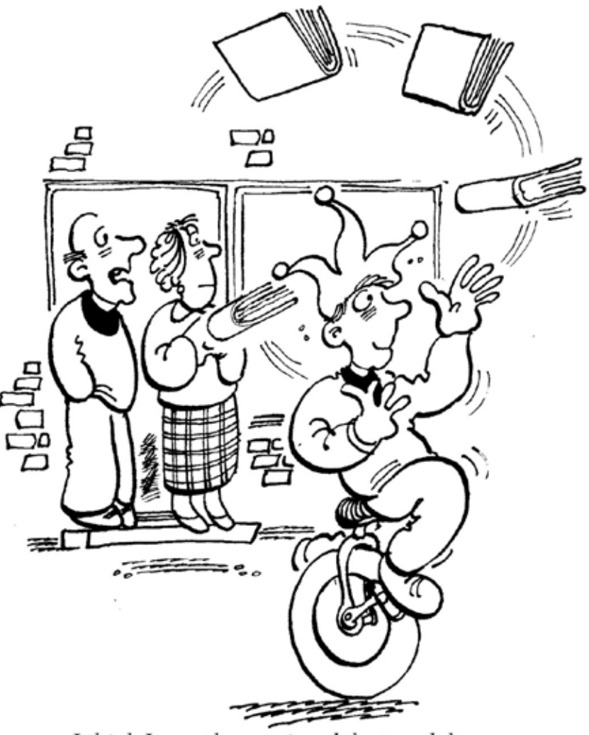
...I think I must have missed that module when I was at theological college!